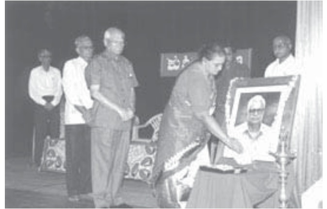
Prof. K.S. Haridasa Bhat Memorial Award function...