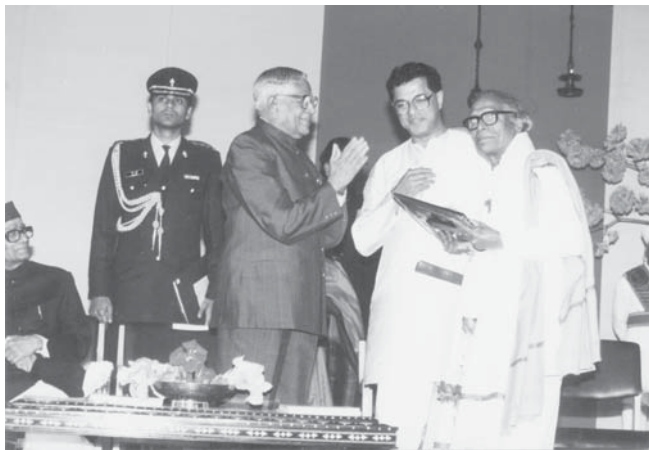
Receiving the Sangeet Natak Akademi Award...